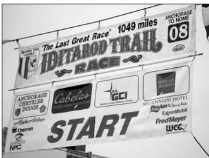
Start sign and beginning of Iditarod